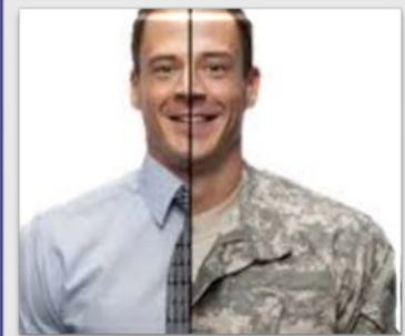
Veterans Transition Assistance Program