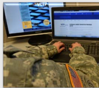
CCMD Required Training