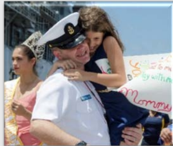
Reservists Yellow Ribbon Reintegration Program