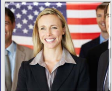
Defense Civilian Personnel