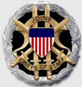
Joint Staff Mil/Civ Required Training

JKO DoD Military, Civilian, Reserve, Military Health Professionals, and Transitioning Veterans