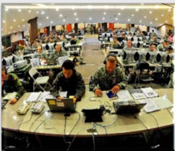
CCMD Exercise Support