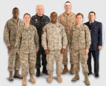
Services Retirement Training