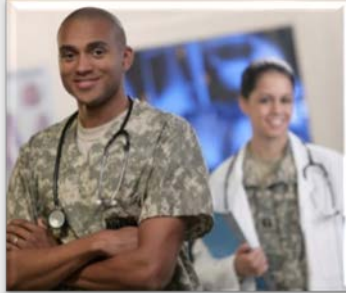
Defense Health Agency