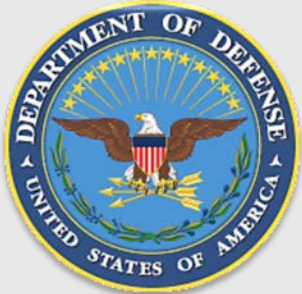
DOD Required Training